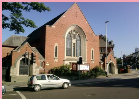
South Parade Baptist Church ...

Issues in our work and UCAN's purpose and activities. We finish at 3.30 pm. with quick refreshments as you leave for home.