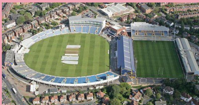
... almost across the road from the Headingley Carnegie Stadium (if you get lost!)

This second series of Area Training Days runs from autumn 2014 to winter 2015/16 and is planned for 13 venues: Ware, Coventry, Woking, Nottingham, Belfast, Stirling, Central London, Manchester, Bristol (all held already), Tonbridge, Leeds, Southampton and the North-East.